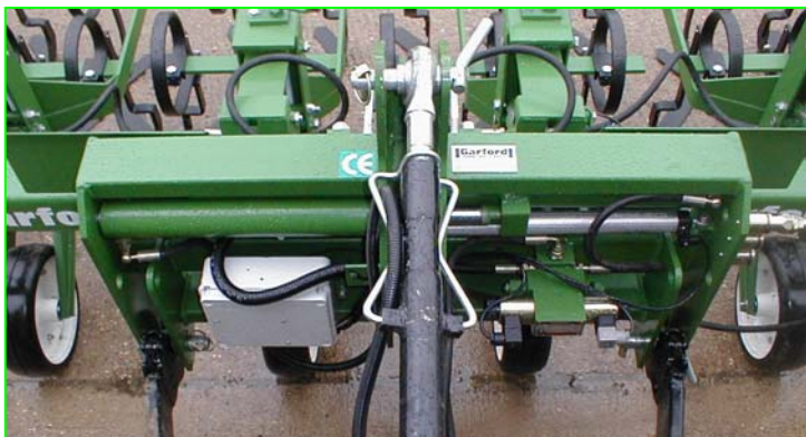
The compact hydraulic sideshift mechanism incorporates the junction box and hydraulic control valve