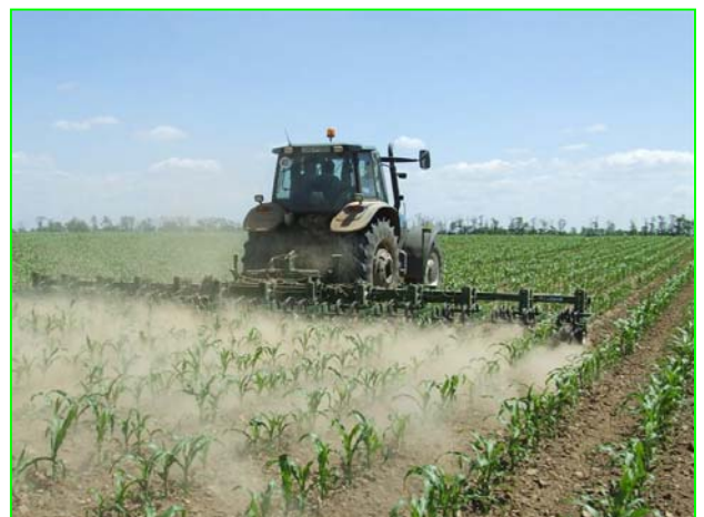
Robocrop enables large rear mounted cultivator to operate swiftly and accurately with reduced operator fatigue.