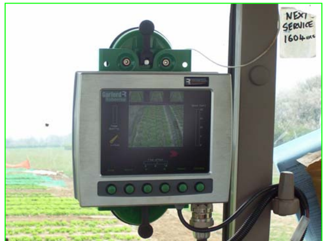
Simple and robust Robocrop console with soft key controls