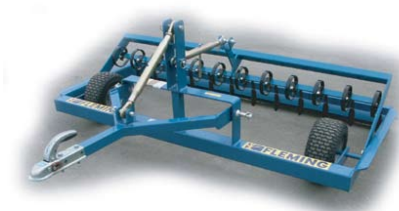
Optional draw bar for quad

Due to a policy of continual improvement the company reserve the righth to change price or specification without notice