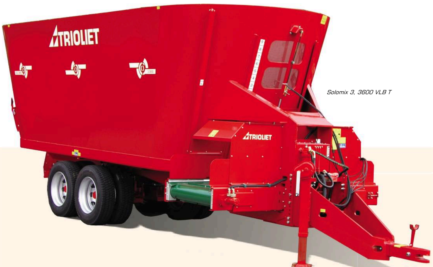
Solomix 3, 3600 VLB T