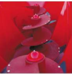
Unique three auger system with horizontal flow system.