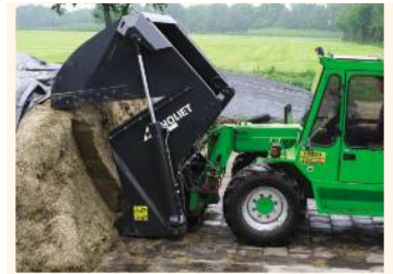
In one go 2.00 m 3 /72 Cu Ft of silage in only a few minutes!